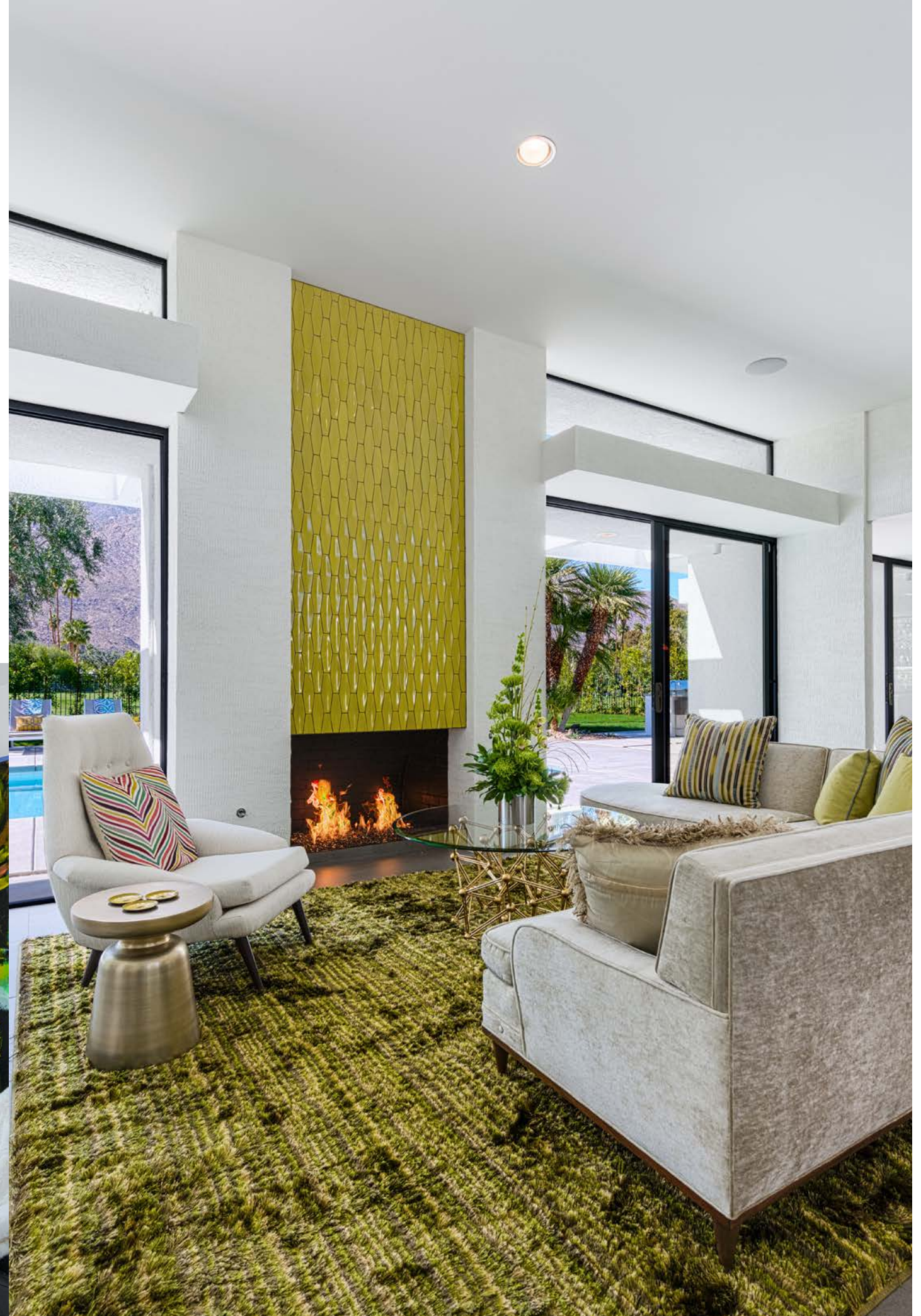
The living room features an original 1950s sectional sofa re-upholstered in velvety Posh Plus Driftwood fabric by Kravet. The rich, olive-colored rug is Kane Carpet Campana from Carpet Empire Plus, the perfect backdrop for the Molecule gold leaf coffee table, available through Egg & Dart. The round Martini side table is West Elm.