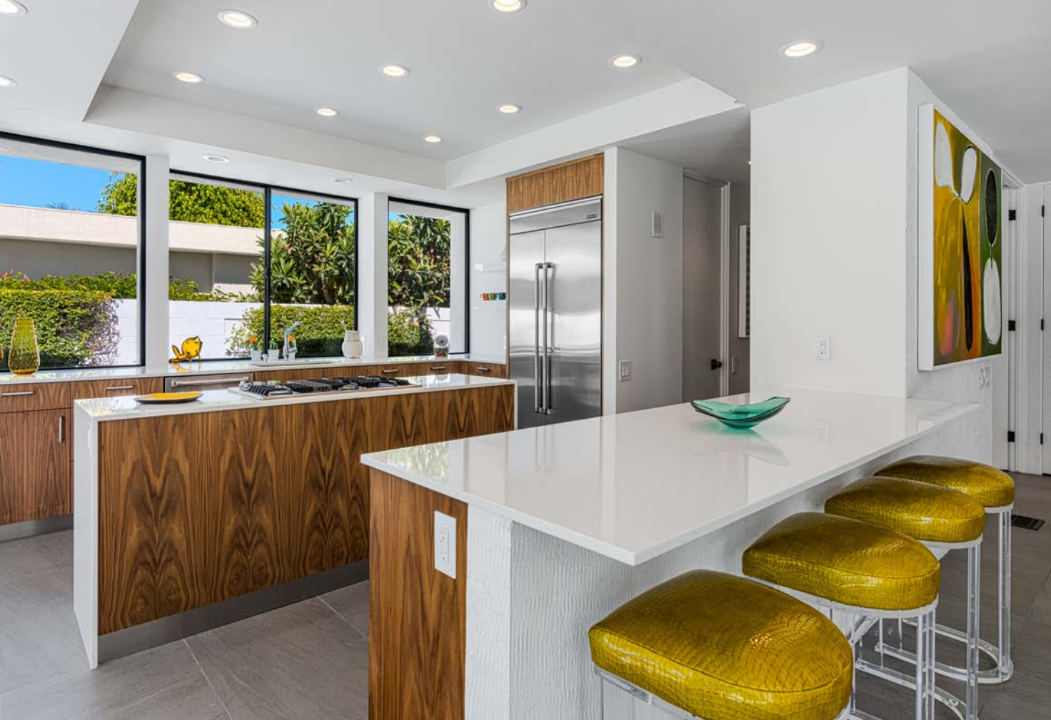
ABOVE The breakfast bar's white quartz countertop provides a bright contrast to the rich, custom walnut cabinetry. The vintage bar stools with Lucite bases sport Garrett Leather seats in DiModa Gatora. RIGHT The office features a glass and chrome vintage desk, which pairs nicely with the tufted wingback chair from Kravet Furniture. Recycled newspaper called "Yesterday's News" is by Innovations in Wall-covering, and bright pops of orange and yellow are introduced via Shawn Savage's abstract art.