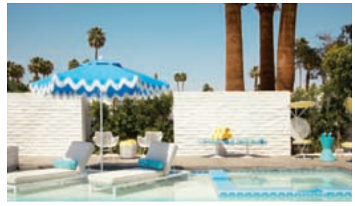
A fringe umbrella shades stainless steel chaise lounges. The pool deck features vintage mesh armchairs and custom chairs and a bench from Trina Turk.

Neighbors say the former homeowners had a life-size Elvis in the living room that could be seen from the fairway behind the home, causing golfers to do a double take. Elvis has left the building, but a Judy Ragagli oil painting of a sultry-eyed Barbie graces one wall of the office that's outfitted with refurbished airport lounge chairs and custom-designed desk and shelves.