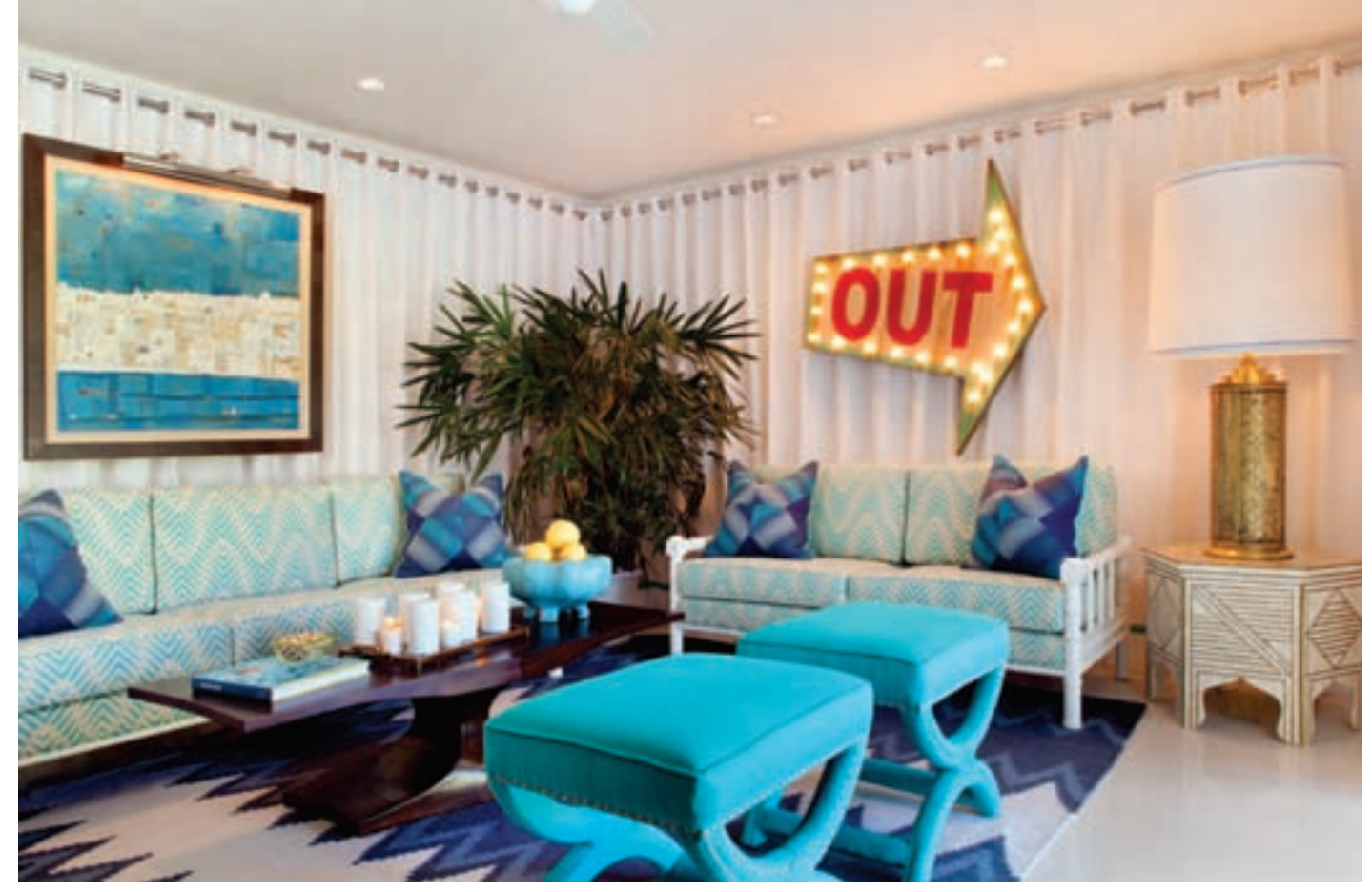
Above: Custom bamboo sofas feature Dwell Studio indoor/outdoor cushions and Larry Laslo Design fabric pillows with a starburst pattern. Three walls are draped in white linen to reduce acoustic noise while providing a rich texture and plush backdrop for brightly colored art. Below left: The vintage breakfast table base is made from lacquered parchment (goat skin) with brass inlay strips; custom Chinese Chippendale side chairs complete the sophisticated look. Below right: Designer Joel Dessaules designed the bed in ebonized ceruse oak and softened the look with custom bedding featuring a zig-zag Martyn Lawrence Bullard print from Schumacher. The mirrored desk is paired with a clear Louis Ghost armchair from Kartell.